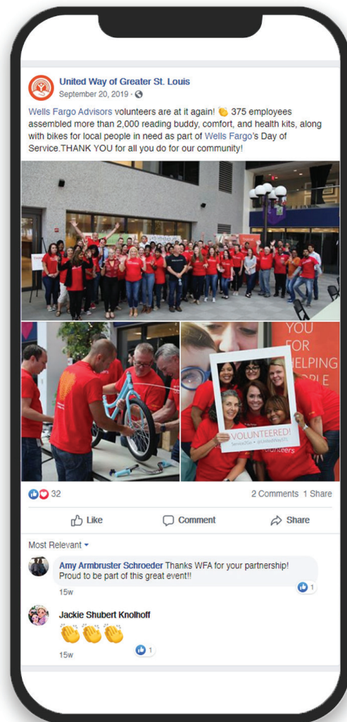
Sample Facebook post

We post on social media throughout the year to thank our Service2Go clients for their volunteerism and contribution to the St. Louis community. Social media posts help increase your company's visibility and engage your employees. Potential social media platforms include Facebook, LinkedIn, Instagram and Twitter.